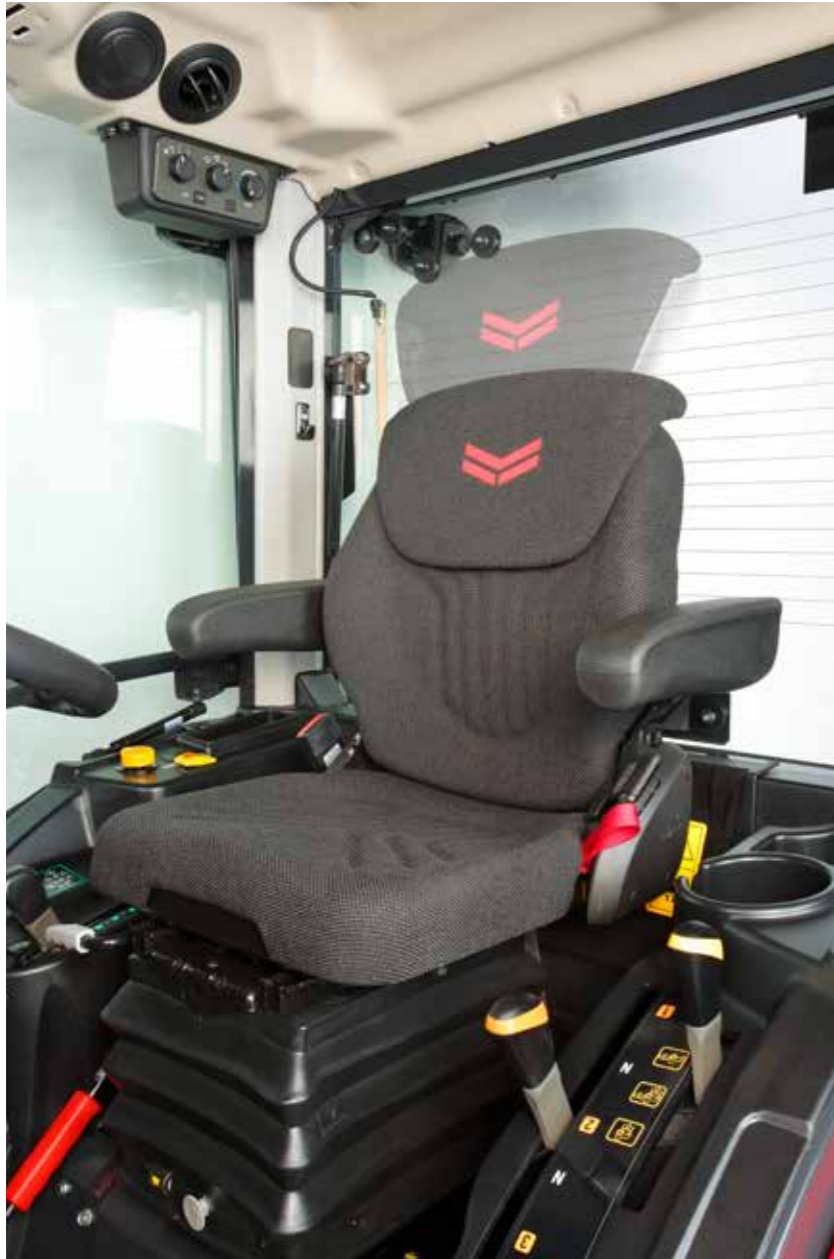
Deluxe seat for optimum comfort