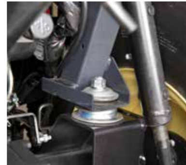
Factory-installed for precision

A system of anti-vibration rubber body mounts has been designed to reduce both vibration and noise while you work, giving you a comfortable ride and keeping you from the conventional wear and tear of extended hours on the job.