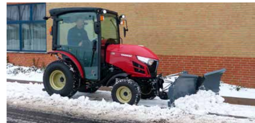
Comprehensive implement range makes these tractors suitable for any application and any weather

Driven directly from the engine and designed to work seamlessly with a wide variety of front-end attachments and implements.