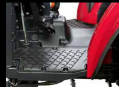
A flat floor provides ample leg room