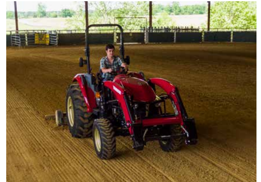
YT2 tractors combine an array of features and characteristics that make them a pleasure to own and to operate

A top speed of 31 km/h affords fast travel between sites and jobs while providing automotive levels of on and off-road performance.