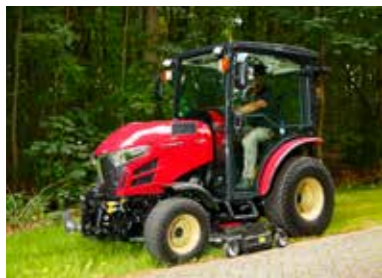
The precision of the mid-mower