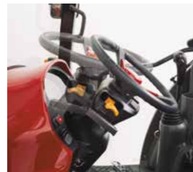
Steering adjustable to suit operator

Full adjustment allows operator to set machine to perfectly match his height, posture and comfort.