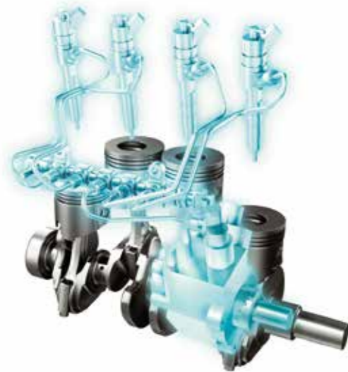
Common-rail Injection system

Strike a balance between high power/high performance and minimised emissions for the lowest possible environmental impact.