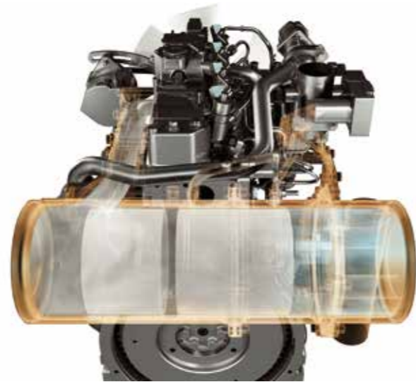
DPF (Diesel Particulate Filter)